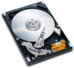
Backup Tape / Hard Drive Data