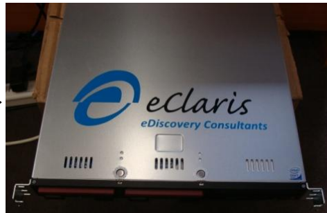
Electronic Discovery Appliance In Your Office