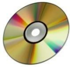
Your DVD / Other Media