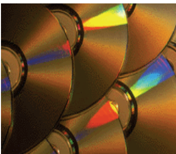
eClarix is Flexible eDiscovery